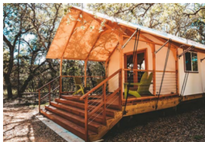
Tent Cottages by Rainier Outdoors

We will be installing two tent cottages at the Neilson Spearhead Center this spring, made possible as part of a generous, multi-year grant from the George W. Neilson Foundation in support of expanded community engagement at Spearhead.